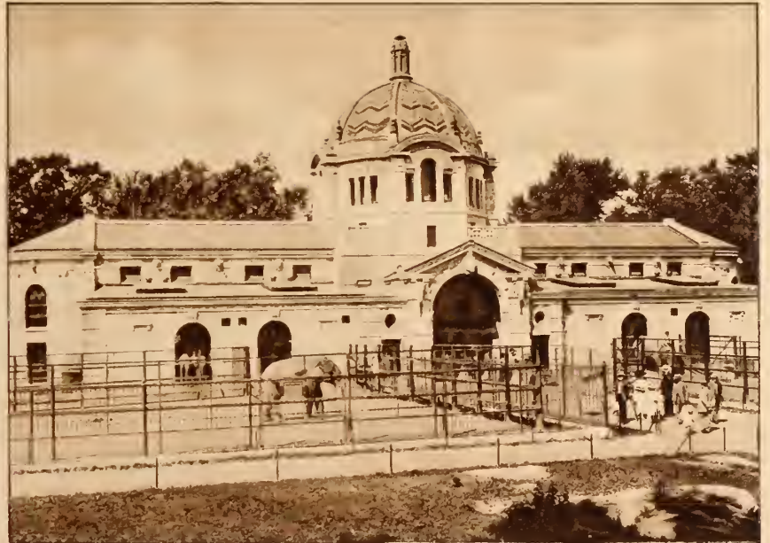
ELEPHANT HOUSE, New York Zoological Garden.